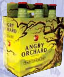
Angry Orchard Hard Cider Traditional Dry $8.99 6pk. (04905)