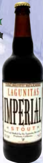
Lagunitas Imperial Stout $4.49 22oz (03833)