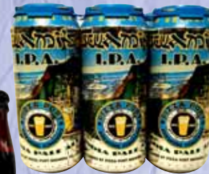
Pizza Port Swami IPA $13.99 6pk (06679)