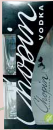
Chopin Potato Vodka w/ 2 shot glasses 750ml $24.95 (10963)