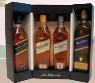
Johnnie Walker 200ml Collection 1 each-Black, Gold, Platinum and Blue 200ml each $99.95 (13478)