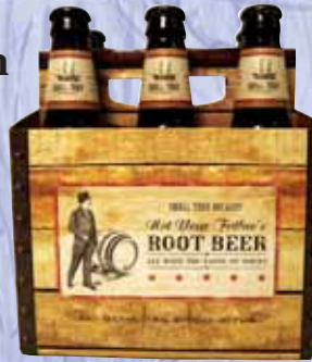
Not Your Fathers Root Beer $11.99 6pk btls (08073)