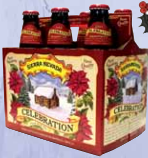
Sierra Nevada Celebration Ale $8.99 6pk (00698)