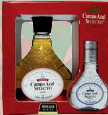
Camp Azul Anejo w/ 200ml Blanco 750ml $24.99 (12074)