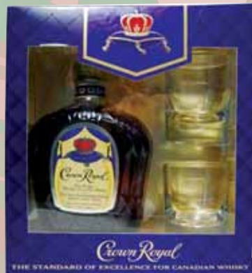
Crown Royal w/ 2 rocks glasses 750ml $19.95 (10465)