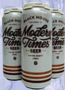
Modern Times Black House 4pk $10.99 16oz. cans (06671)