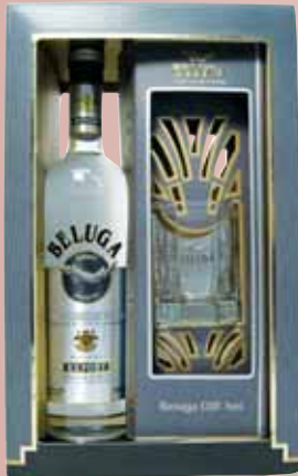
Beluga Vodka Noble w/ rocks glass 750ml $27.99 (03350)