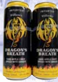
Dragons Breath Hard Apple Cider spiced with ginger $8.99 4pk (06956)