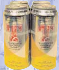
Tennents Lager $7.99 4pk (07805)