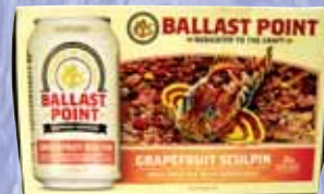
Ballast Point Grapefruit Sculpin $14.99 6pk Cans (07989)