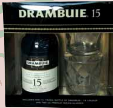
Drambuie 15 w/ 2 rocks glasses 750ml $49.99 (07459)