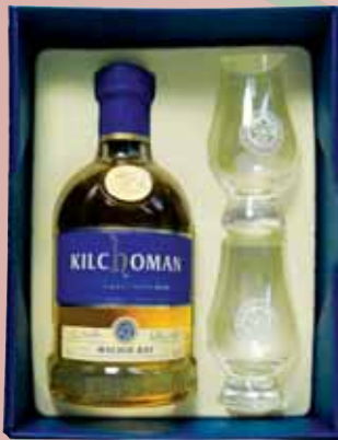
Kilchoman Machir Bay w/ 2 Glencairn Glass 750ml $57.99 (05030)