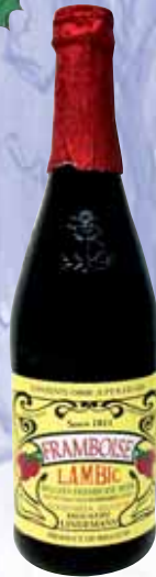
Lindemans Framboise $9.95 750ml (13024)