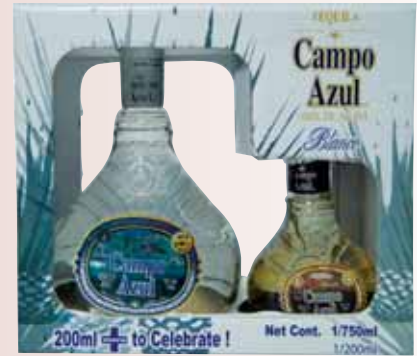
Camp Azul Blanco w/ 200ml Reposado 750ml $21.99 (01300)