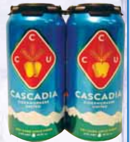
Cascadia Dry Hard Cider $8.99 4pk (08401)