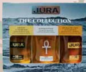
Jura The Collection 3 pk 50ml - 10yr 50ml - Superstition 50ml - 16yr $11.95 (05575)