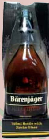
Barenjager Honey & Bourbon w/ rocks glass 750ml $29.95 (04907)