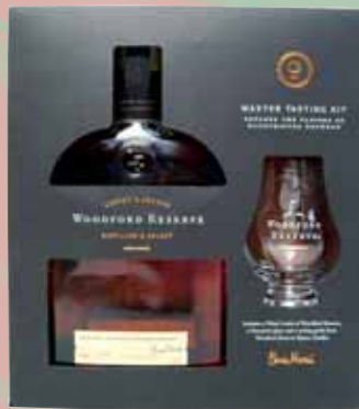
Woodford Reserve Bourbon w/ Glencairn Glass 750ml $27.95 (11550)