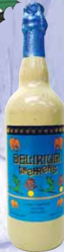
Delirium Tremens $12.99 25oz. (10342)