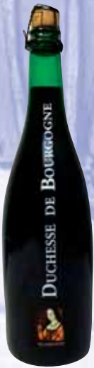
Duchesse De Bourgogne $11.99 750ml (02877)