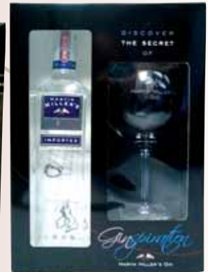
Millers Gin w/ Balloon Glass 750ml $21.95 (13844)