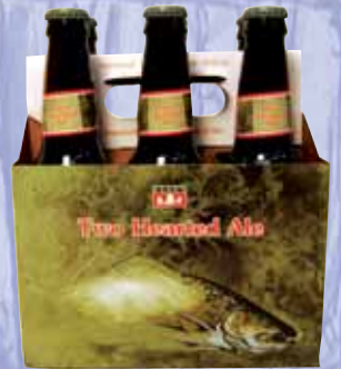
Bells Two Hearted Ale $10.99 6pk btls (07790)