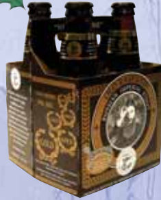
Old Rasputin North Coast Imperial Stout $ 8.99 4pk (00300)